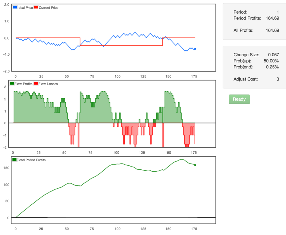
Figure 2: Screen example.

this line to the distance between Ideal Price and Current Price you can get a feeling for how differences between the two influence earnings.